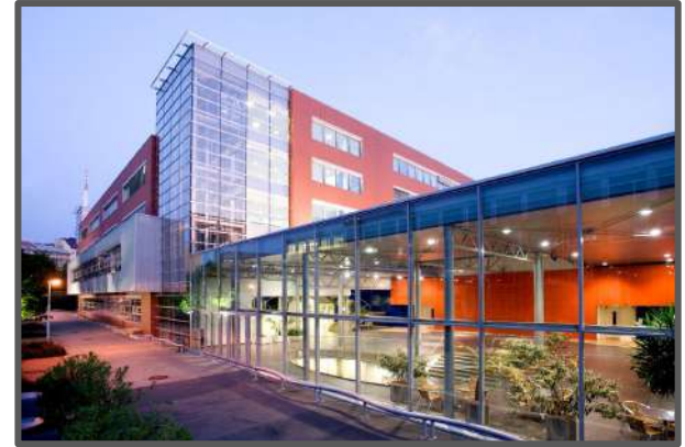
College of Economics