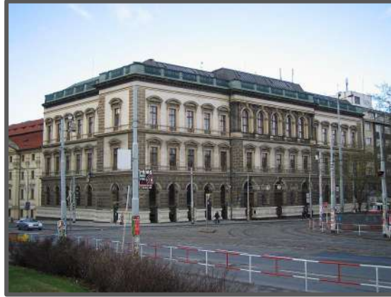
Czech technical university